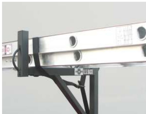
FIG 15 – Ensure strap also goes over crossbar