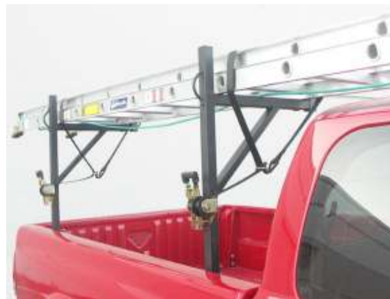
FIG 13 STEP 2 – Drape Ladder and Hook Strap