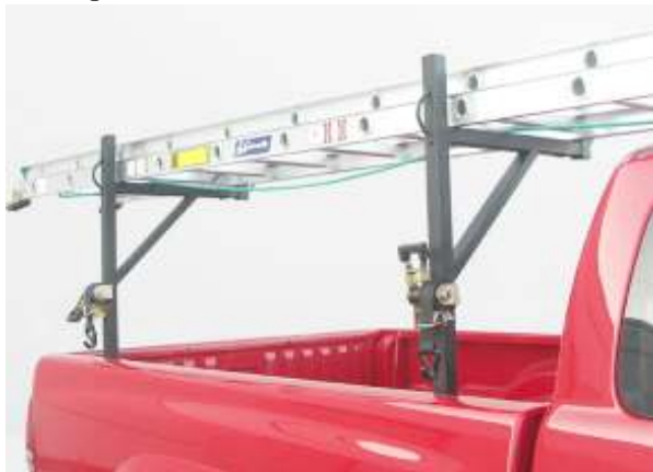
FIG 12 STEP 1 - Place ladder on Rack

12. SECURING CARGO ON THE RACK. Place the ladder on the rack (FIG 12). When loading a ladder or other long cargo on the rack ensure that it is reasonably balanced so that the weight is shared nearly equally between the front and back portion of the rack. When securing the ladder, loosen the ratchet strap and drape it over the ladder so the end of the strap hangs down. Place the hook through the ring on the strap, ensuring first that the strap also goes around the horizontal cross-bar (FIGS 13 and 15). Tighten until the strap pulls the ladder tightly against the near side of the rack (FIG 14). Tug on the strap near the connection of the hook and ring to take out any slack and then tighten again. Do NOT carry any cargo without tying it securely to the rack; supplemental tie-down hooks are provided on the rack for use with additional ropes or straps if needed.