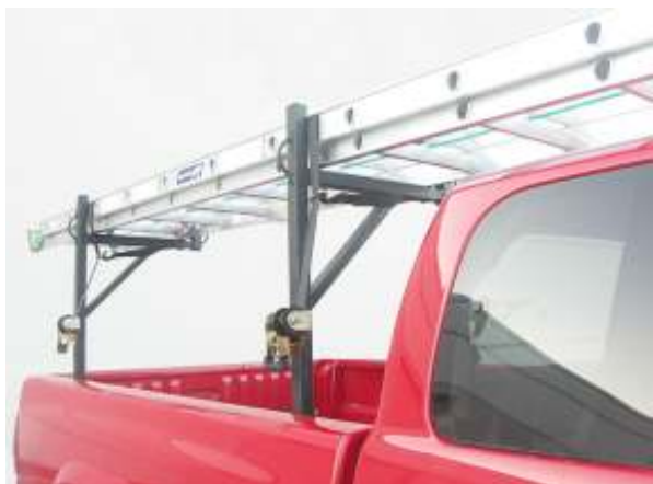
FIG 14 STEP 3 – Tighten Ratchet