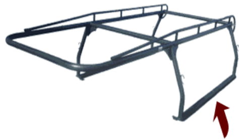
The Super Clamp works with racks with full length base rails