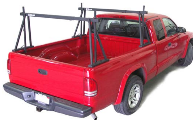
Fig. C (on Tacoma)