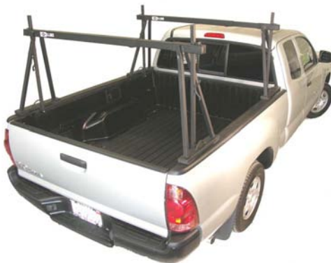
FIG. H – Rack mounted on a Toyota Tacoma