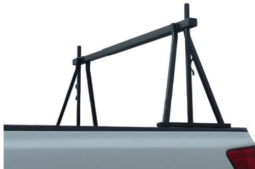
Fig. F-2 (on Titan)