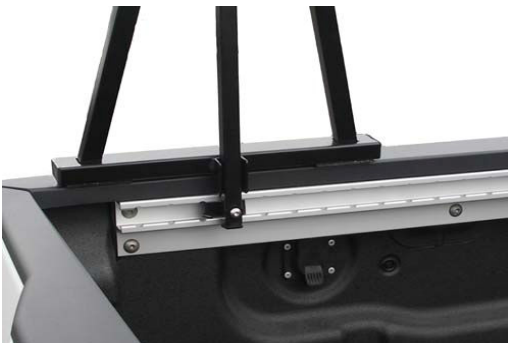
Fig. F-1 (on Titan)

If you have a Nissan truck, examine the Nissan Insert Plate, which is a 2.5" long rectangular plate with a hole in the center. Insert the threaded spindle of the Track Insert into this hole and notice that this has the effect of increasing the side of the Insert to fit the larger Nissan Utili-track system. After placing the plate on the Track Insert, install the Insert in the same manner as shown above. Also see Figures F-1 and F-2.