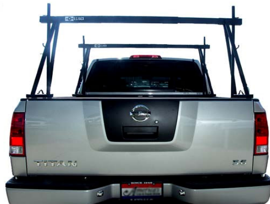
FIG. I – Rack mounted on a Nissan Titan