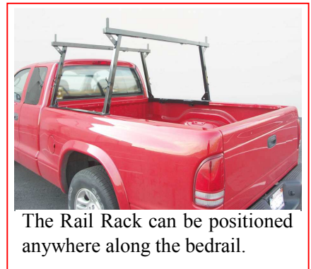
The Rail Rack can be positioned anywhere along the bedrail.

Install your rack in 5 minutes WITHOUT DRILLING . Our powerful integrated clamping system works with conventional bedrails and adapts to work with track systems on newer Toyota and Nissan trucks.