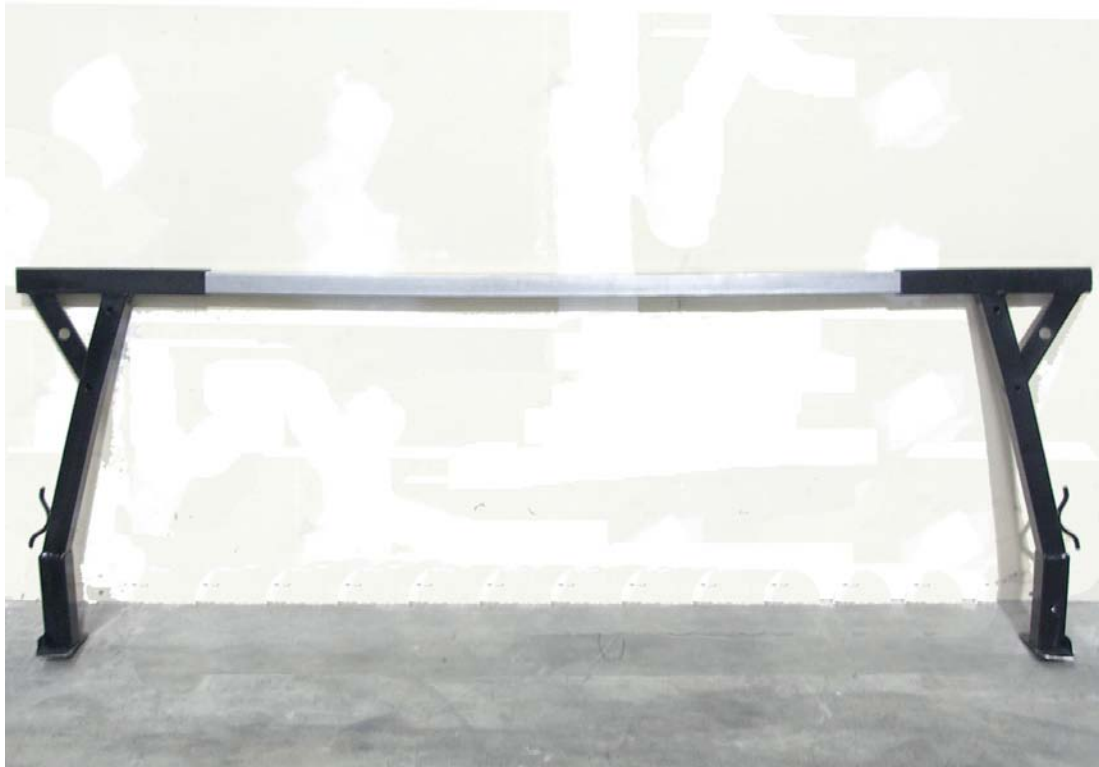
OLDER STYLE STAKE POCKET RACK SHOWN AFTER TEST AT OVER 2,350 LBS.

NOTE: The configuration of the current model Stake Pocket Rack looks slightly different than the model tested. It employs an adjustable crossbar which increases the thickness of the crossbar near the center. Updated test results for the new style are pending, but the new configuration is expected to significantly outperform the older style shown and tested above.