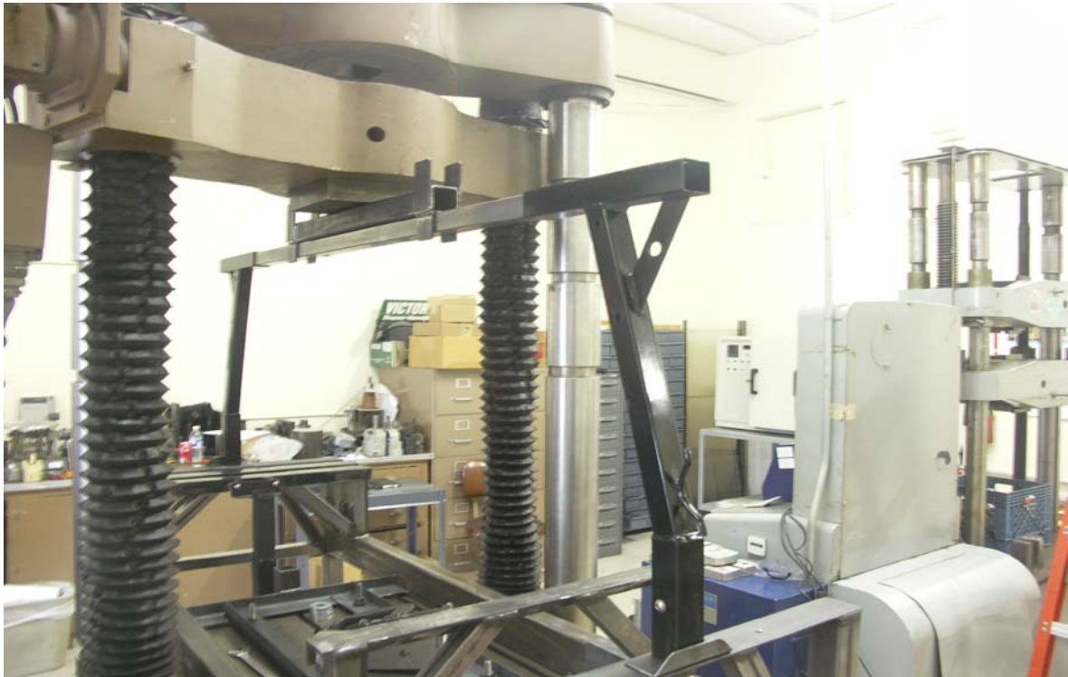
TEST APPARATUS WITH OLDER STYLE STAKE POCKET RACK DURING TEST