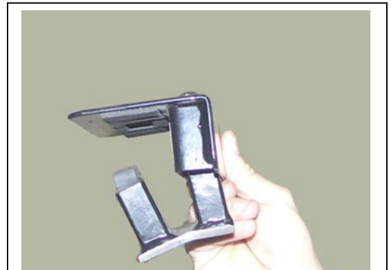
BENT SUPERCLAMP SHOWN AFTER THE TEST AT OVER 2,000 LBS.

Test Summary Counter: 9972 Elapsed Time: 00:02:18 Anamet Job Number: 5004.1089 Specimen Identification: Super Clamps standard#18 Operator: eaf/bck Comments: center lift Procedure Name: Compression Load Start Date: 12/17/2007 Start Time: 3:13:20 PM End Date: 12/17/2007 End Time: 3:15:38 PM Workstation: Anamet Tested By: Ed