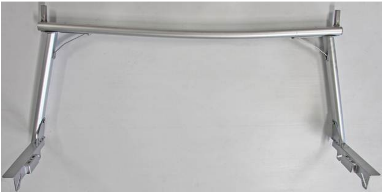
BENT WINDSTREAMER RACK SHOWN AFTER THE TEST AT OVER 1,890 lbs.

WARNING: This data is provided for information only. DO NOT ASSUME BECAUSE LABORATORY TEST RESULTS INDICATE THIS PRODUCT WILL CARRY MORE THAN THE LOAD LIMIT THAT YOU CAN SAFELY EXCEED THIS LIMIT IN ACTUAL USE. STATIC LOADS ARE NOT THE SAME AS THE DYNAMIC LOADS OCCURING DURING USE. OTHER FACTORS, INCLUDING ADDITIONAL LOADING CAUSED BY BRAKING, ACCELERATING, TURNING AND TRAVELING ON SLOPED OR BUMPY SURFACES AMPLIFY FORCES IN ALL DIRECTIONS AND CAN LEAD TO MATERIAL FATIGUE OR FAILURE OF THE RACK OR THE TRUCK BED IF PUBLISHED LOAD LIMITS ARE EXCEEDED. DO NOT EXCEED LOAD RATING