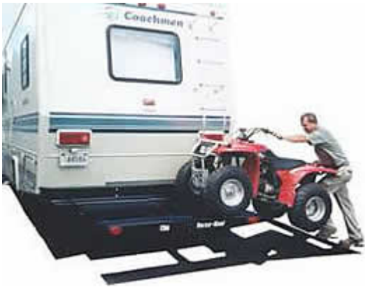
ATV and Go-Kart Carrier with Ramp

Some states require you to have a taillight kit if you extend an object beyond a certain point on your hitch. If you're worried about visibility, or are required by law to add taillights, pick up a tailgate kit with optional license plate light. This increases visibility, keeps you legal in every state across the nation, and provides you with turn signals, break lights and blinkers.