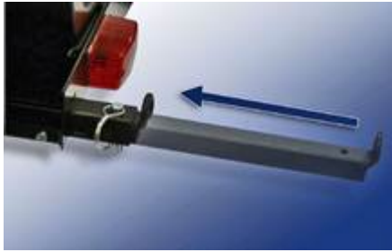
Retractable Tie-Down Bars

This carrier includes Retractable Tie-down Bars with sturdy steel tie-down loops at the ends. Just pull out the locking pin and slide them in. You can complete confidence that your bike is secure.