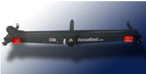
Optional Tailgate Kit

Hitch mounted trailers can cover or obscure your brake lights. This could reduce visibility at night, so a pair of reflectors is included on every carrier.