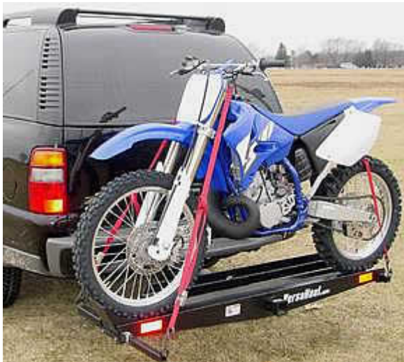
Single Dirt Bike Carrier with Ramp

The Versahaul™ design features lead the way.