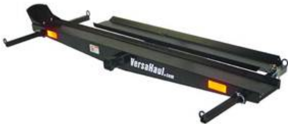
Model 2011-VH-SPORT RO