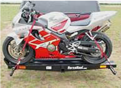
Sport Bike Carrier with Ramp

This carrier includes Retractable Tie-down Bars with sturdy steel tie-down loops at the ends. Just pull out the locking pin and slide them in. You can complete confidence that your bike is secure.