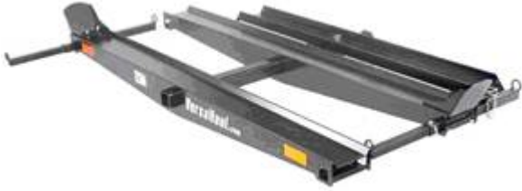
Model 2011-VH-55 DMRO