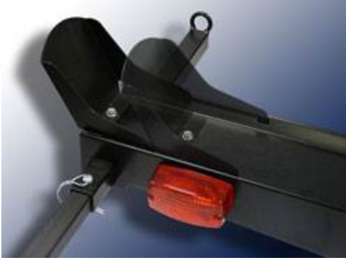
Adjustable Wheel Stop

Wheel stops are designed to help stabilize your bike, but they must be properly positioned to be useful. These wheel stops are adjustable to fit your bike better.