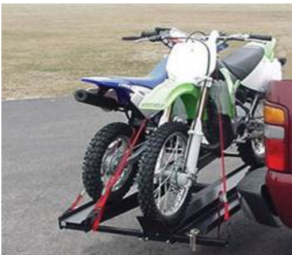
Double Dirt Bike Carrier with Ramp

You shouldn't have to worry about hauling a spare tire or a bumper that is too big. If your vehicle can take the weight, this carrier will let you haul it. VersaHaul was designed with a moveable rail that allows you to move the rail closer or farther from your vehicle